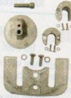
Bravo II, III No. PRF 10061A