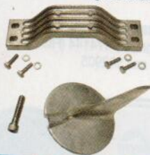
10182A - Yamaha 200-250HP Four Stroke

Comes with mounting hardware. Anodes have wear indicator that appears as the anode wears.