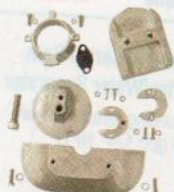
Alpha I Gen II No. PRF 10059A

Available for Alpha Gen I and II, Bravo I, II, and III drives. Wear indicators included!